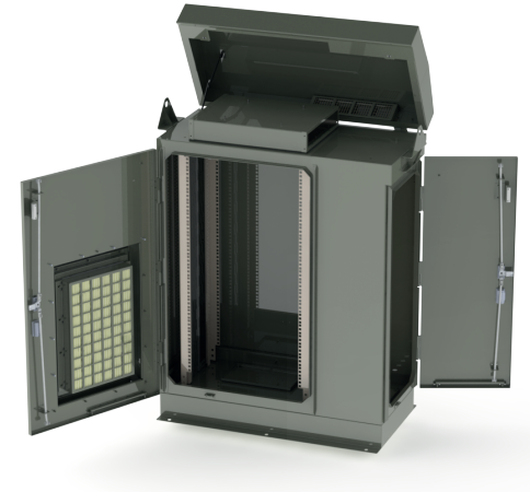
Single Bay + End Pod

Our enclosures are supplied fully assembled ready for immediate deployment.