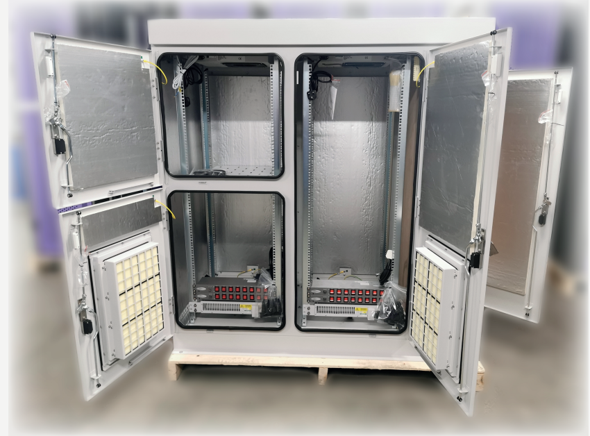
Customised Solution for housing multiple operators