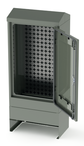
FTTH Drop Cabinet